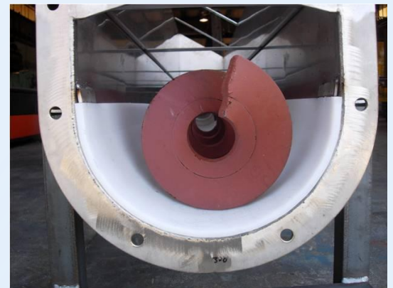
Figure 2 Proven Shaftless Design